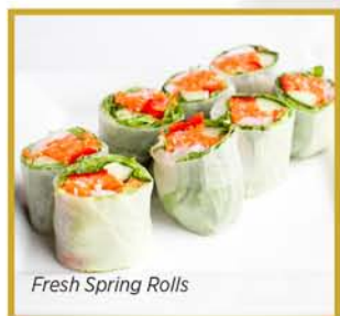
Fresh Spring Rolls