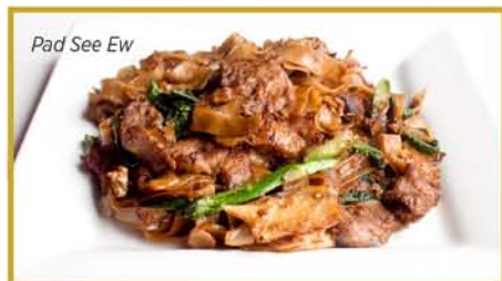
Pad See Ew

Chicken, Beef, or Tofu $12.95 Tiger Shrimp or Mixed $14.95